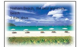
Naiham Beach, the best and lovely beach, 7 min. drive