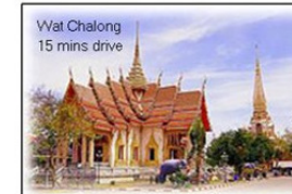
Wat Chalong, 15 mins drive