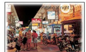
Patong at night