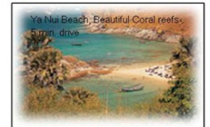
Ya Nui Beach, Beautiful Coral reefs, 5 min. drive