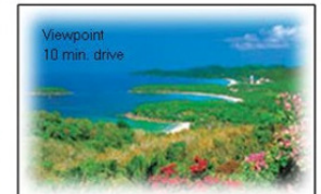
Viewpoint, 10 min. drive