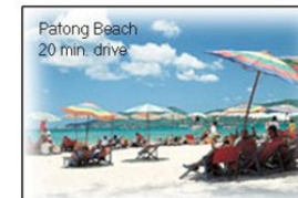
Patong Beach, 20 min. drive